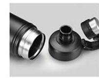
ITEM NO:PA23134-50 CAPACITY:17OZ ITEM NO:PA23134-75 CAPACITY:25OZ