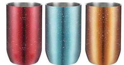
ITEM NO:PA23153-42 CAPACITY:14OZ

18/8 Stainless Steel and BPA FREE More 20 Surface finish available