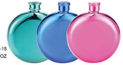
ITEM NO:PA23150-15 CAPACITY:5OZ