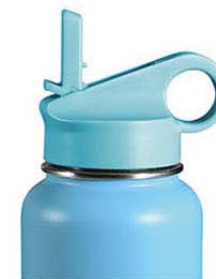
Sports Nozzel Lid