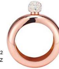
ITEM NO:PA23149-12 CAPACITY:4OZ