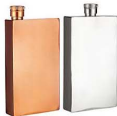
ITEM NO:PA23147-21 CAPACITY:7OZ