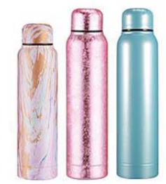
ITEM NO:P23013-33 CAPACITY:11OZ ITEM NO:P23014-50 CAPACITY:17OZ

18/8 Stainless Steel and BPA FREE More 20 Surface finish available Copper coating and vacuum technology can keep 24 hours cold and 12 hours hot Support Low MOQ with Customized package and private label with competitive price