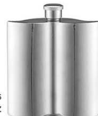
ITEM NO:PA23148-15 CAPACITY:5OZ

18/8 Stainless Steel and BPA FREE More 20 Surface finish available