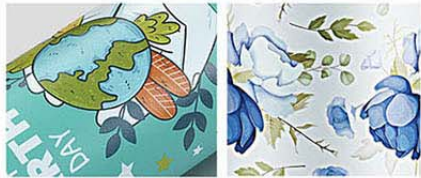
Matt 3D printing