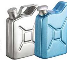
ITEM NO:PA23151-12 CAPACITY:4OZ