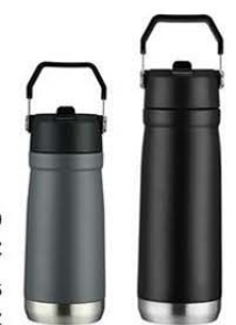
ITEM NO:PA23135-50 CAPACITY:17OZ ITEM NO:PA23135-75 CAPACITY:25OZ