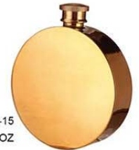
ITEM NO:PA23152-15 CAPACITY:5OZ